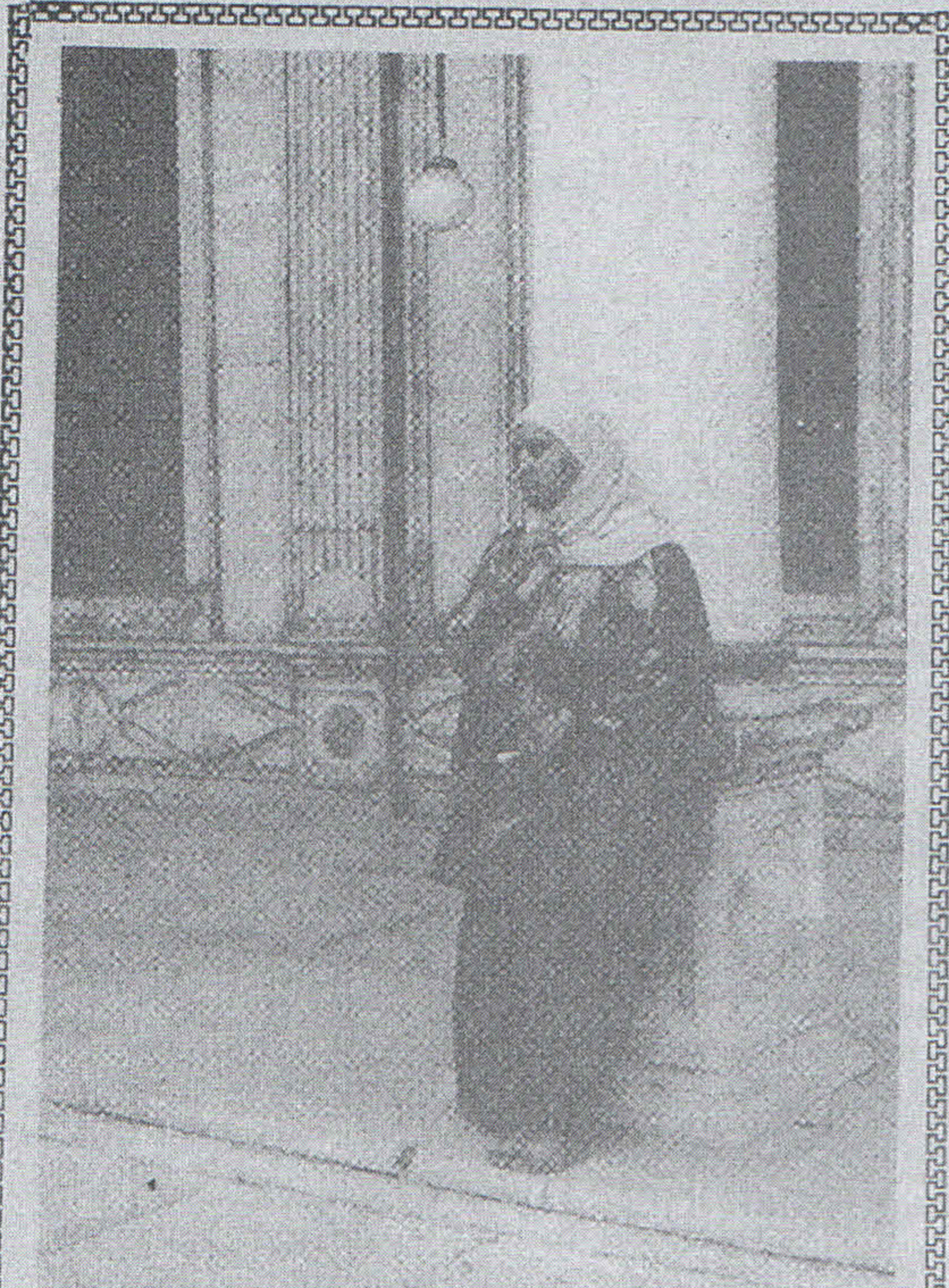
Egyptian woman wearing typical attire, standing in front of a mosque in Cairo, Egypt.

the Great Pyramid of Cheops. We began first in the Queen's chamber then we assembled in the King's chamber where we used a 7-sided, 8-sided and 13-sided crystal. The walls vibrated with the intensity of our chanting and the love we released. The chamber itself was purified with the crystals we had made in the P.R.I. laboratory. A special crystal was left in the King's chamber as a reminder of our love