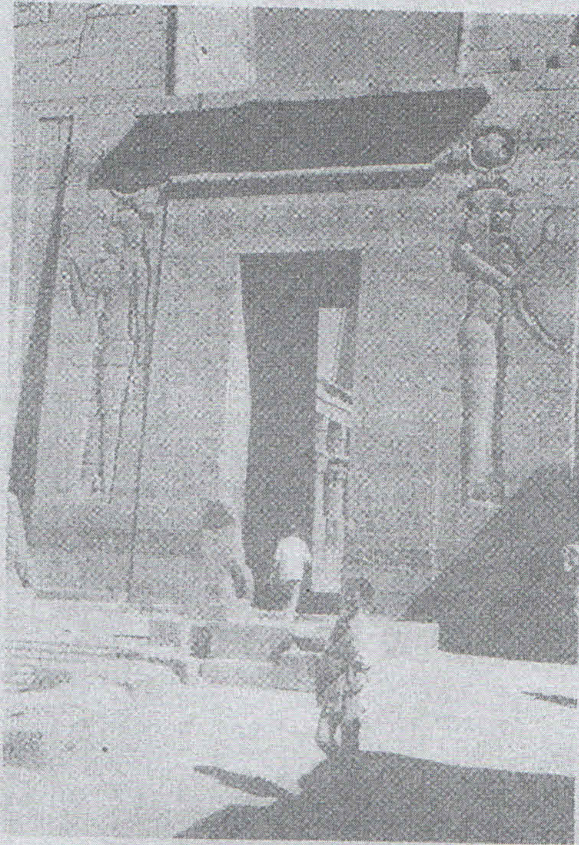
Temple of Thebes on the Nile River.

When we arrived at Abydos, I took the group through a 7-fold meditation in the 7 chapels