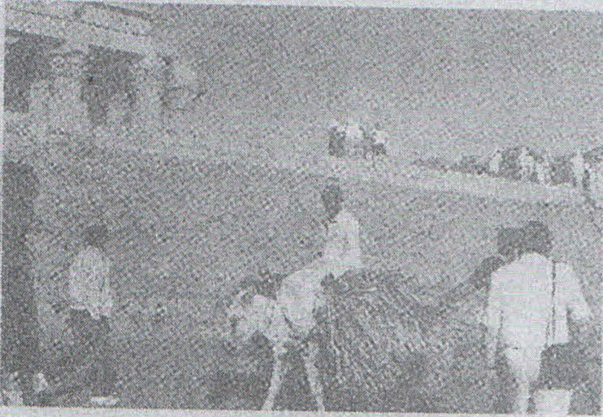
Egyptian man transporting bullrush, a bamboo-like plant. The Luxor temple in the background.

crystals. I gave a short presentation on "Records are written in stone".